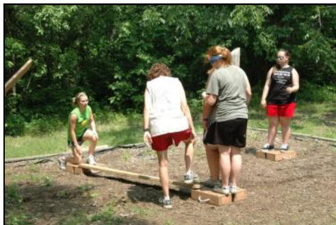
YOUTH RETREAT-TEAM BUILDING